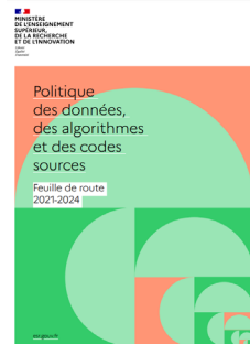
Data policy, algorithms and source codes (2021-2024)

The development of the repository and the catalog has been entrusted to INRAE, which was joined by 7 other establishments