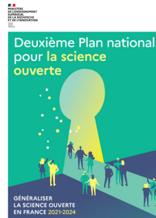
The second national plan for open science (2021-2024)

Recherche Data Gouv is a flagship project included in the strategies of the Ministry of Higher Education and Research